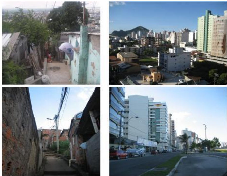
Figure 1: Partial views of the Alto Bairro da Penha (left) and of Praia da Costa (right)

This study therefore concerns the role of techniques: it involves understanding the socio-spatial fragmentation through the access to electricity within two socially and economically unequal neighbourhoods, and how this disparate access is conducive to social domination 4 .