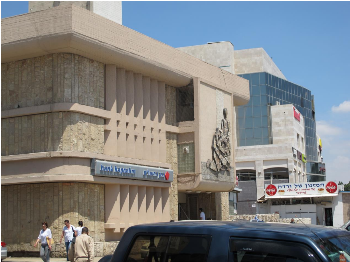
Former town hall transformed into a bank, in the background, the shopping center that houses the new town hall on the top floor.