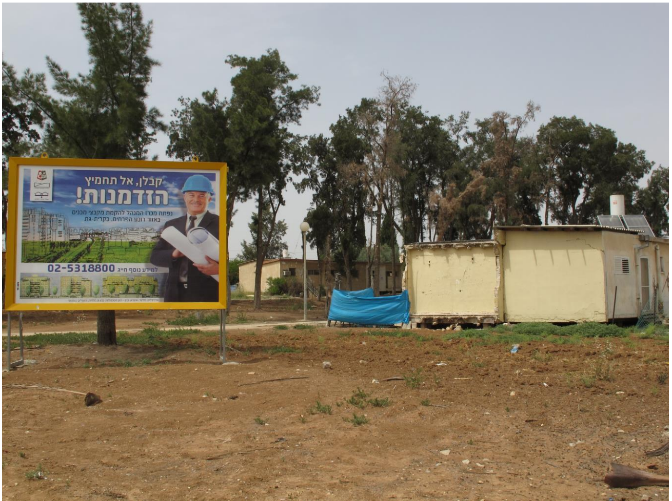
On the left, a poster showing the ambitions of the municipality, on the right, the old ma'abarot doomed to political neglect