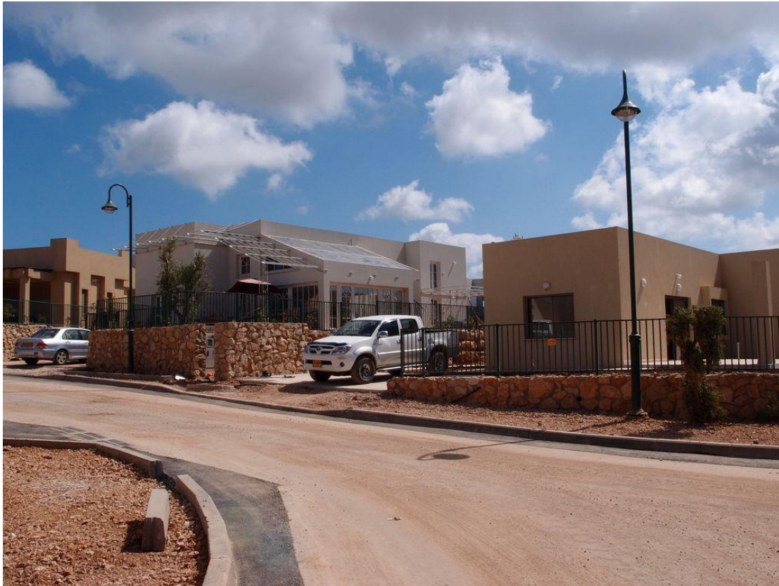
New residential area according to development plans in an era of privatization. Kibbutz Hanita 2012.

(irreversible) structural evolution, their residents receiving the keys to their purchased 4 already demarcated and fenced lot. Common spaces are reduced to a minimum in these neighborhoods.