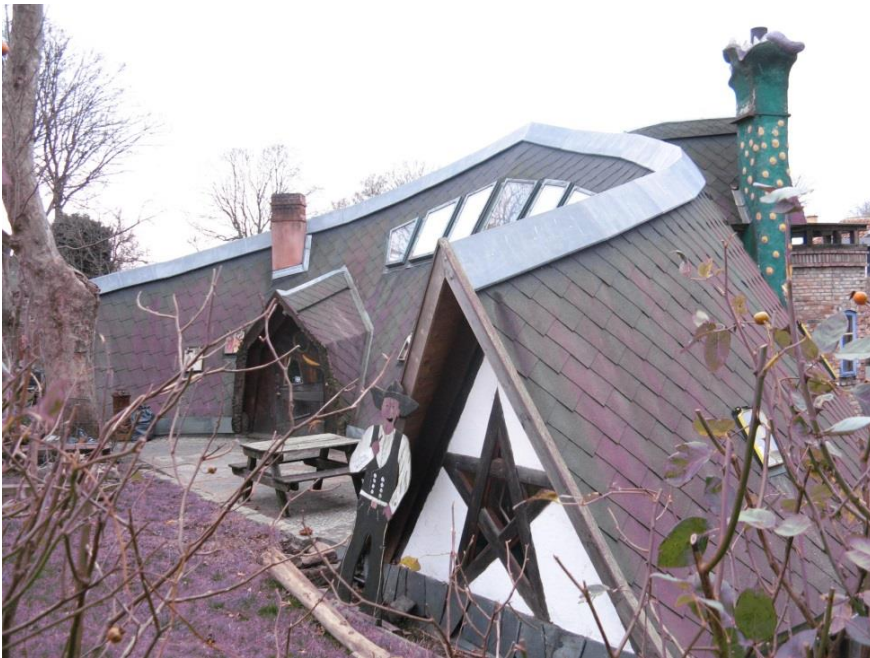
Figure 2: The back of Bananhuset.

Similarly, residents of Bacon's New Atlantis live in brick-built houses with glass windows. Both authors equate the ingress of light into dwellings with progress. While More imagines a plaster that performs something like Ordinary Portland Cement (OPC) 20 , though fundamentally different in being 'no-cost', Bacon's 'Chambers of Health' could be read as prefiguring concerns with indoor air quality (IAQ), particularly as contemporary sustainable architecture looks to increasingly draught-proof designs such as Passivhaus . By contrast, the patriarch protagonist of The Isle of Pines quickly knocks together a cabin of unhewn timber poles clad with boards recovered from his shipwreck and roofed with stretched sail-cloth, before getting down to the serious business of creating what Susan Bruce dubs 'pornotopia' - a place 'where mossy banks and trees provide all the shelter that one needs' (Bruce, 2008, p. xxxix).