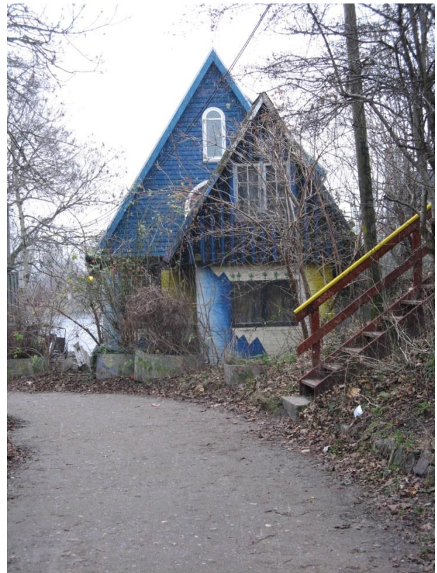
Figure 3: Christiania housing by the waterside