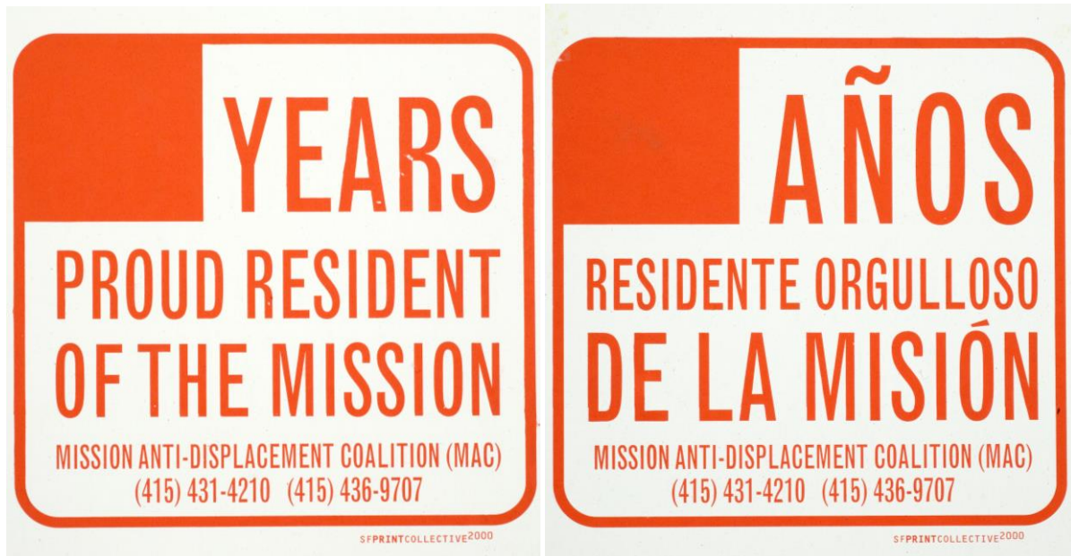
Figure 1: Residential Claims (Source: San Francisco Print Collective, reproduced with permission; www.sfprintcollective.com ): During the first dot-com boom the Mission Anti-Displacement Coalition (MAC) illustrated its support visually through the community by encouraging residents to put signs like this in apartment windows. Produced by the San Francisco Print Collective, which created a set of freely accessible posters that commented in the rise of gentrification, the set of images here raised claims of ownership and permanence, in Spanish and English.

Revendications des résidents (source : San Francisco Print Collective, publié avec autorisation, www.sfprintcollective.com ): Pendant le premier boum internet, la Mission Anti-Displacement Coalition (MAC) a lancé une campagne visuelle dans la communauté pour appuyer leurs revendications : les résidents étaient encouragés à afficher des posters comme celui-ci aux fenêtres de leur logement. Produite par le collectif San Francisco Print, cette série d'affiches, distribuées gratuitement, critiquaient l'accélération du processus de gentrification. Ici, le poster revendique, en espagnol et en anglais, le sentiment d'appropriation des habitants et de la permanence dans le quartier,